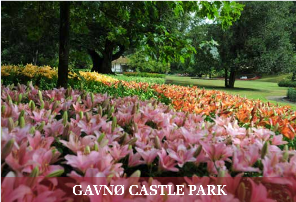
GAVNØ CASTLE PARK

Since the 18th century, the historic garden, has offered large collections of thousands of flowers and rare trees. In April, many variants of the early spring invigilators can be enjoyed, such as daffodils, pearl hyacinths, crocuses and others. In May, the country's well-known and most spectacular tulip exhibition can be experienced. Tulips are replaced by thousands of summer flowers and in August, the country's only lily festival in a symphony of colors and scents can be enjoyed. The rose garden is flourishing from July until October. The garden develops throughout the season and always offers our guests a sensual experience.