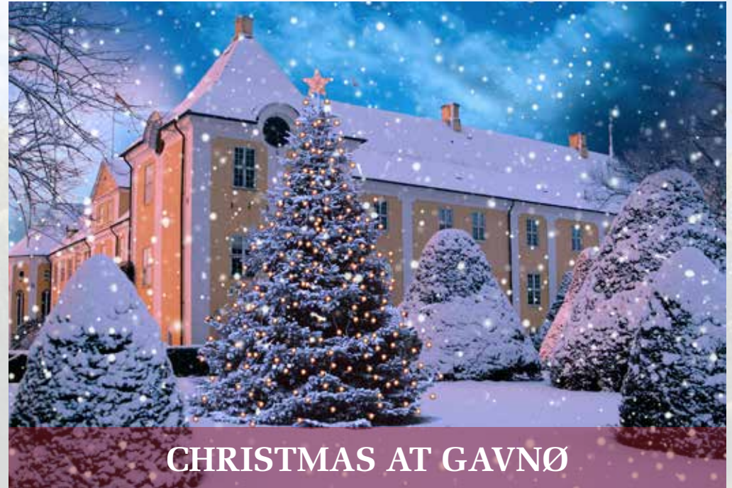
CHRISTMAS AT GAVNØ

Visit Denmark's largest Christmas market with 150 stands in the historic farm buildings from the 19th century. All stands are carefully selected, and we emphasize quality and diversity. Here you will find a large selection of handicrafts, delicacies and food, Christmas decorations, wine and handicrafts.